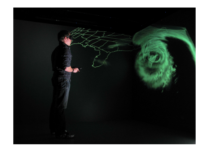
Fig. 3. HurricaneVis in the MSU VERTEX

HurricaneVis is a promising prototype that is successfully used to evaluate and investigate numerical or measured weather model data. The superior image quality from direct volume rendering presents a promising and user friendly way to evaluate extensive, 3D, time-dependent data. The interactive modification of transfer functions is very appealing to users. The user study confirmed our expectations